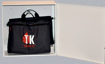
Bleeding Control Station with Go-Bags