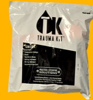
Individual Trauma Kits Include: