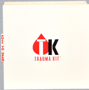
Bleeding Control Station