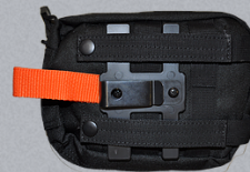
IFAK with Visor Clip